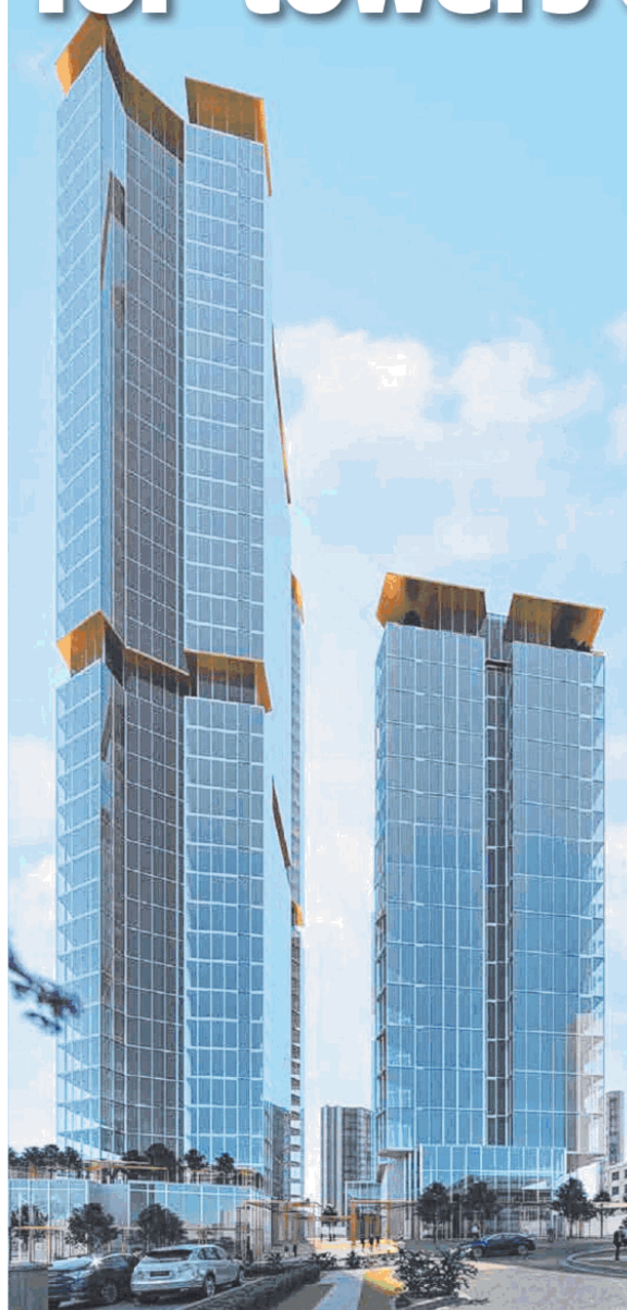
An artist's impression of a proposed "towers of power" government precinct.